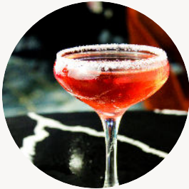
Crimson Zest Cranberry & Lime Juice with Sugar Syrup