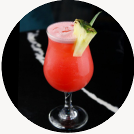
Florida Mocktail Grapefruit, Orange & Cranberry Juices