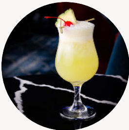
Tropical Glow Orange & Pineapple Juices with Coconut Puree