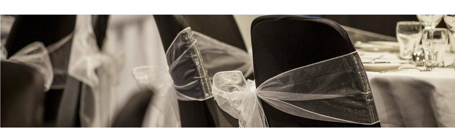
Table runners Linen napkins Favours

Ceremony Styling Swagging for bridal, gift & cake tables Fairy lights