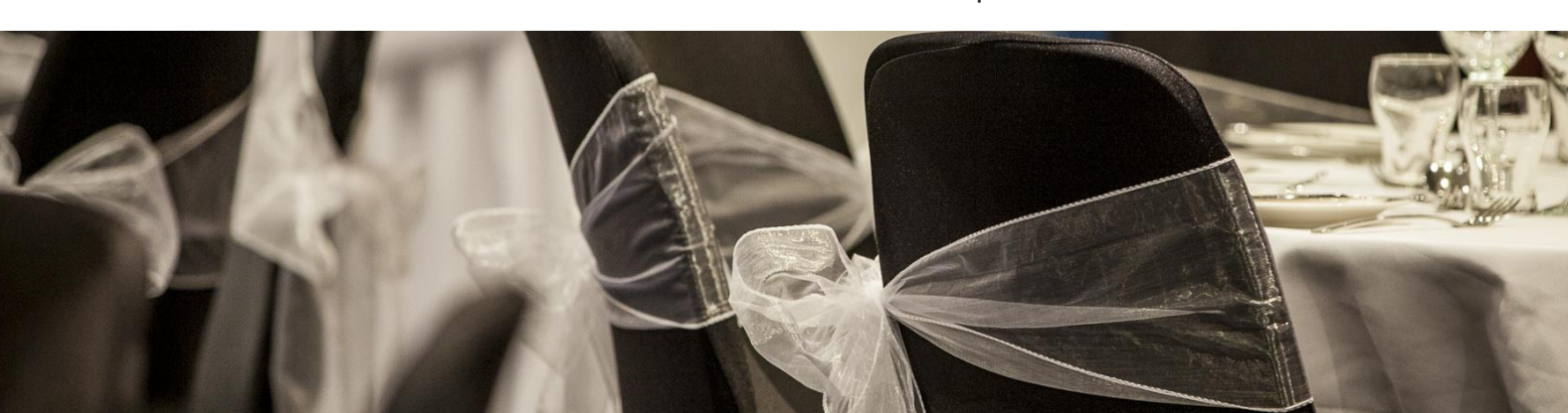
Table runners Wedding trees with fairy lights Tea light votives Linen napkins

Fairy lights Swagging for bridal, gift & cake tables Diamante scatters in various colours Helium balloon chandelier